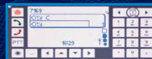
VIRTUAL CONSOLE SCREEN