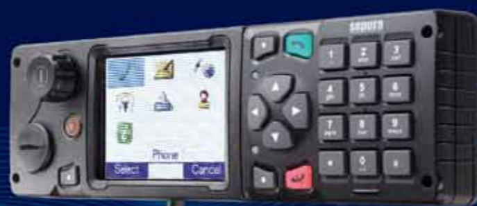
SCC BLACK BEZEL