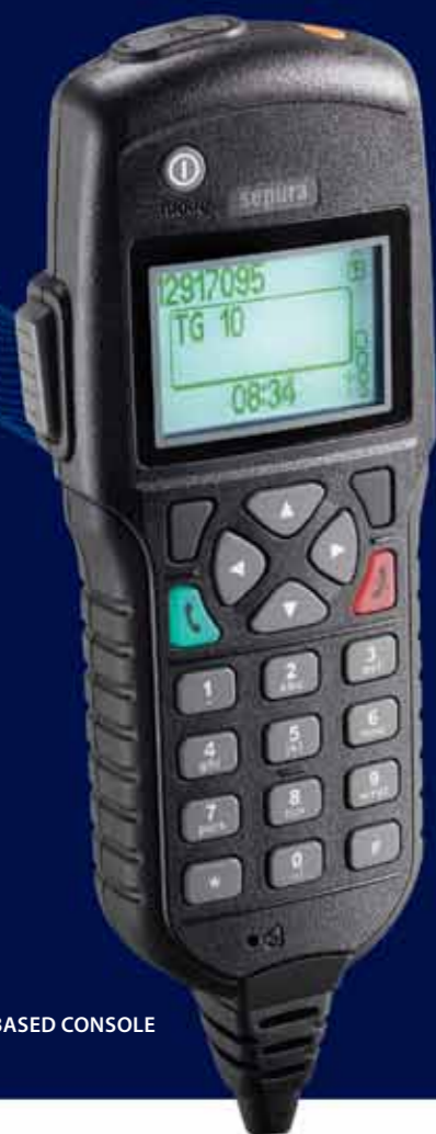
HANDSET BASED CONSOLE