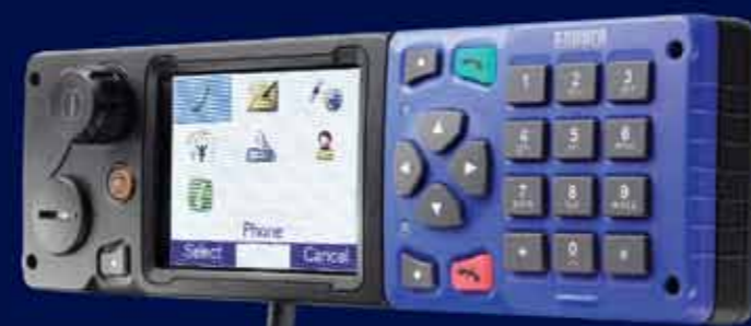
SCC BLUE BEZEL